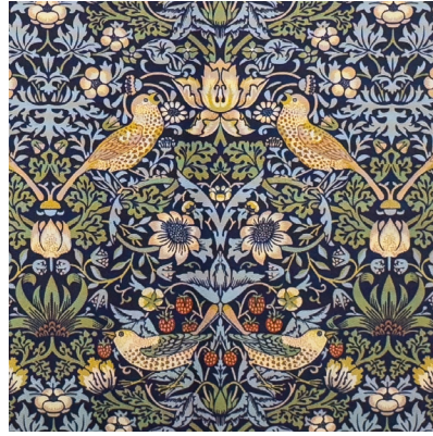
Strawberry Thief Navy