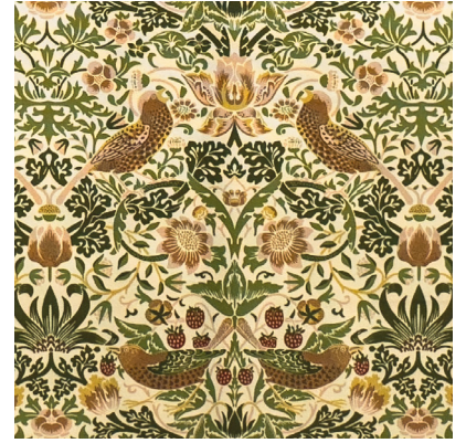
Strawberry Thief Natural