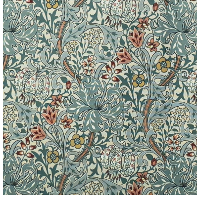
Golden Lily Natural