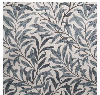
Willow Boughs Azure