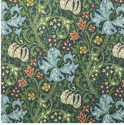
Golden Lily Azure