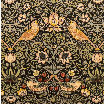
Strawberry Thief Black