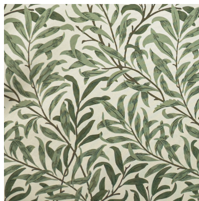
Willow Boughs Sage