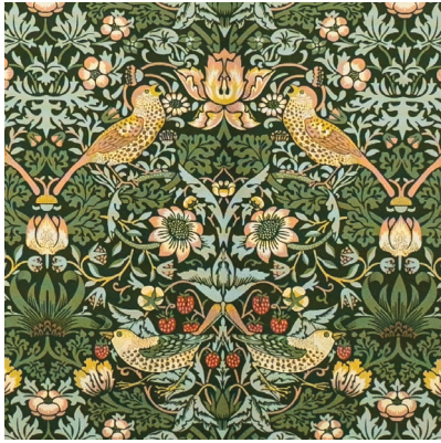
Strawberry Thief Forest