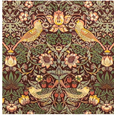
Strawberry Thief Burgundy